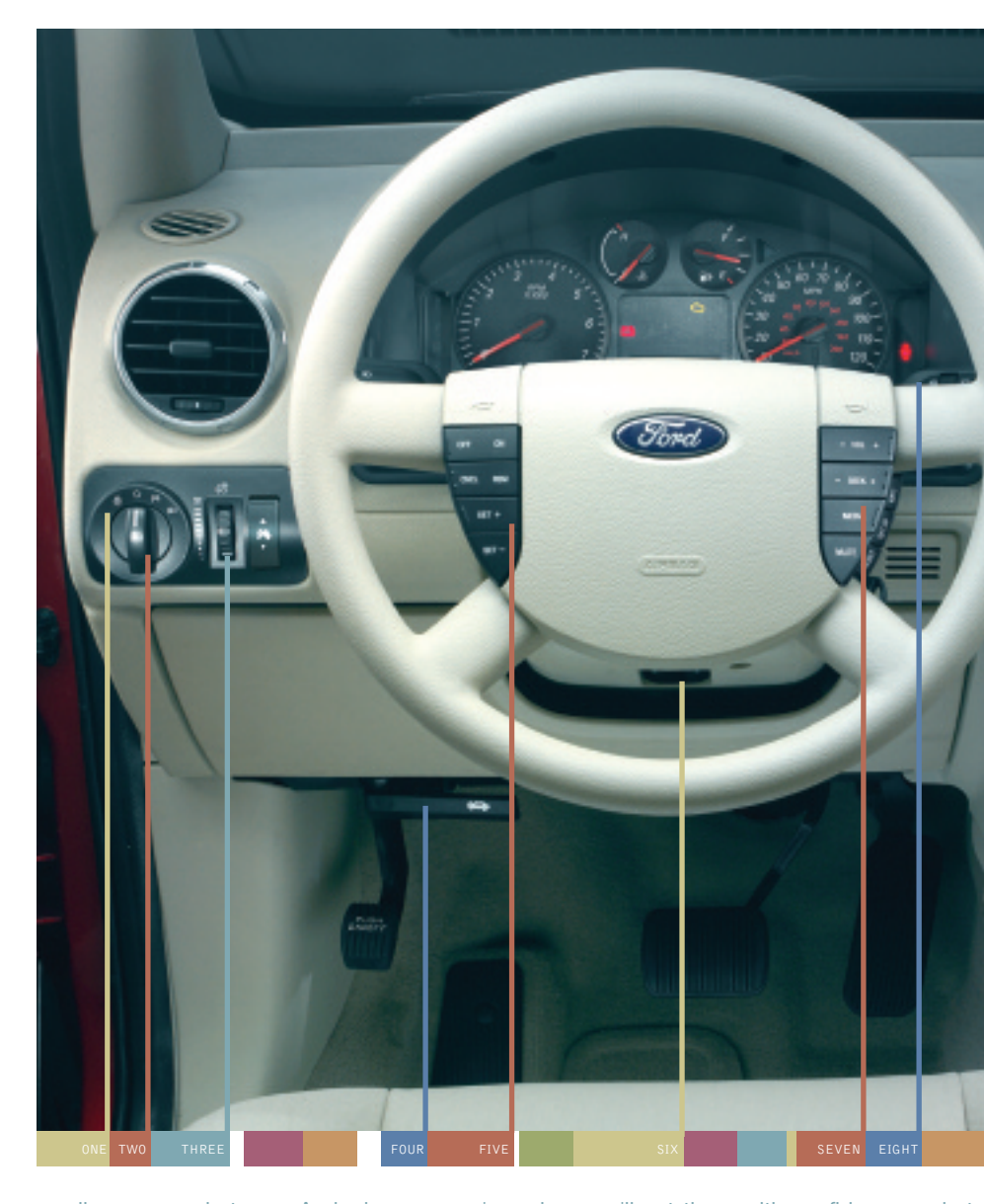
, you really are... ready to go. And wherever you're going, you'll get there with confidence and sty tight city streets to snow-covered country roads, your adventures are about to begin. So, ir new Freestyle and its features. For the most detailed information, please consult your O